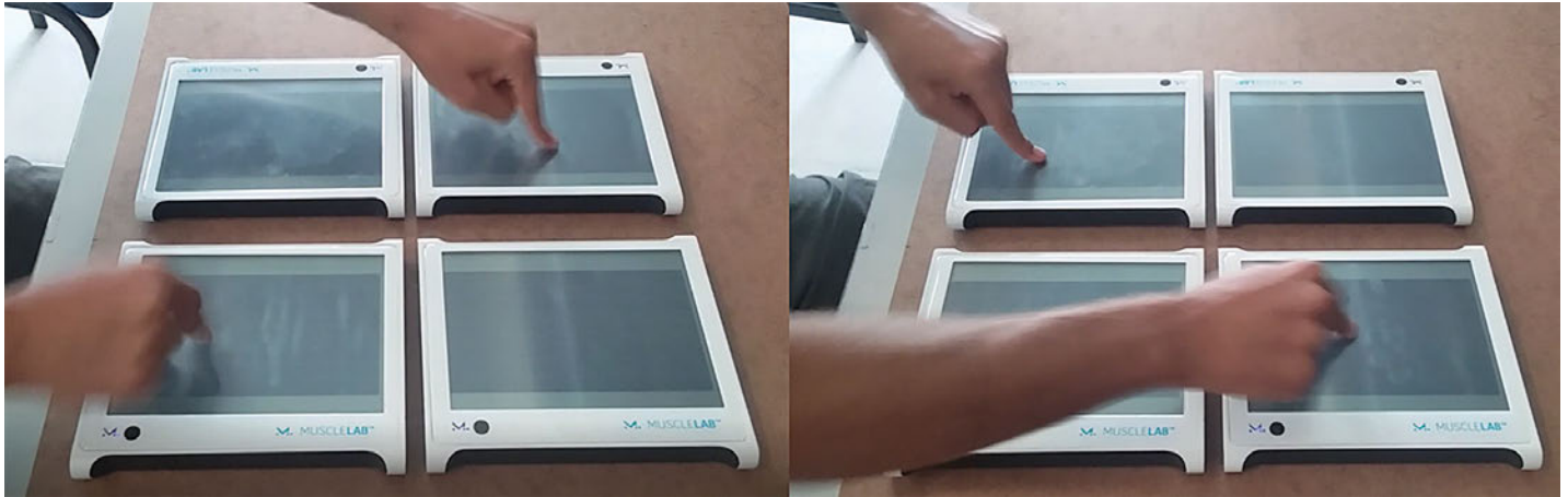
Figure 1: Instrumented tapping pads developed to provide quantitative measures of motor coordination impairment. In this test the participant has 15 sec to achieve as many cycles as possible, moving their hands as quickly and accurately as possible between the targets.

weighted dry land measures determine into which classification the athlete is placed, as each classification is represented by a specific range of bench-test scores. Second, an in-water assessment involves a technical (coach) observation of the athlete swimming in the water. Thereafter, the bench-test score may be adjusted, resulting in the final classification assignment. When compared to the previous classification system, the inclusion of the water test did improve the sport-specific 'functional' assessment of the athlete. Nevertheless, the system is still fundamentally an 'observational' assessment with limited use of technology.