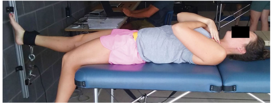
Figure 2: Example of an isometric strength tests developed to determine lower limb strength impairment in Para-swimmers. Relatively inexpensive load cells allow for quantitative measures to be collected during standardised testing procedures.

Guidelines have recently been provided for the systematic development of instrumented tests of muscle strength for the purpose of classification 2 . One of the key recommendations is to develop isometric measures of muscle strength that assess the para athlete's force generating capacity in multi-joint positions that are standardised and specific to the sport of interest. Figure 2 provides an example of an isometric (static)